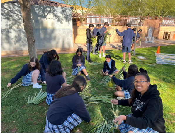
7th and 8th grade students preparing palms

Throughout the school year our students participate in various acts of service. All classes participated in our annual food drive for HOPE, blanket drive for HOPE, and toy drive for St. Vincent de Paul. This year our third grade students volunteered at Feed My Starving Children where they made enough boxes of food to feed 72 children for a year. Our seventh and eighth graders carried on the tradition of preparing the palms for the Palm Sunday mass. The second graders continued perhaps our most loved service project, sending birthday cards to aging parishioners.