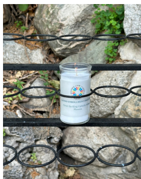
A candle was lit and a prayer said at the Grotto for the students, staff, and families at CTK