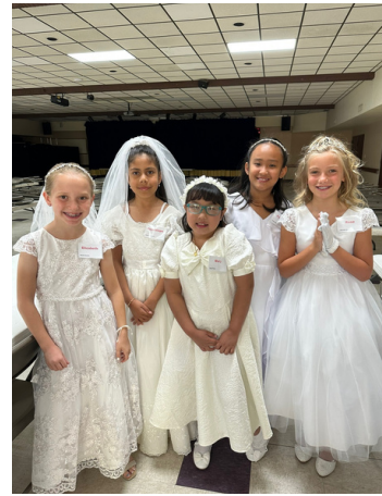
3rd Graders receiving their sacraments